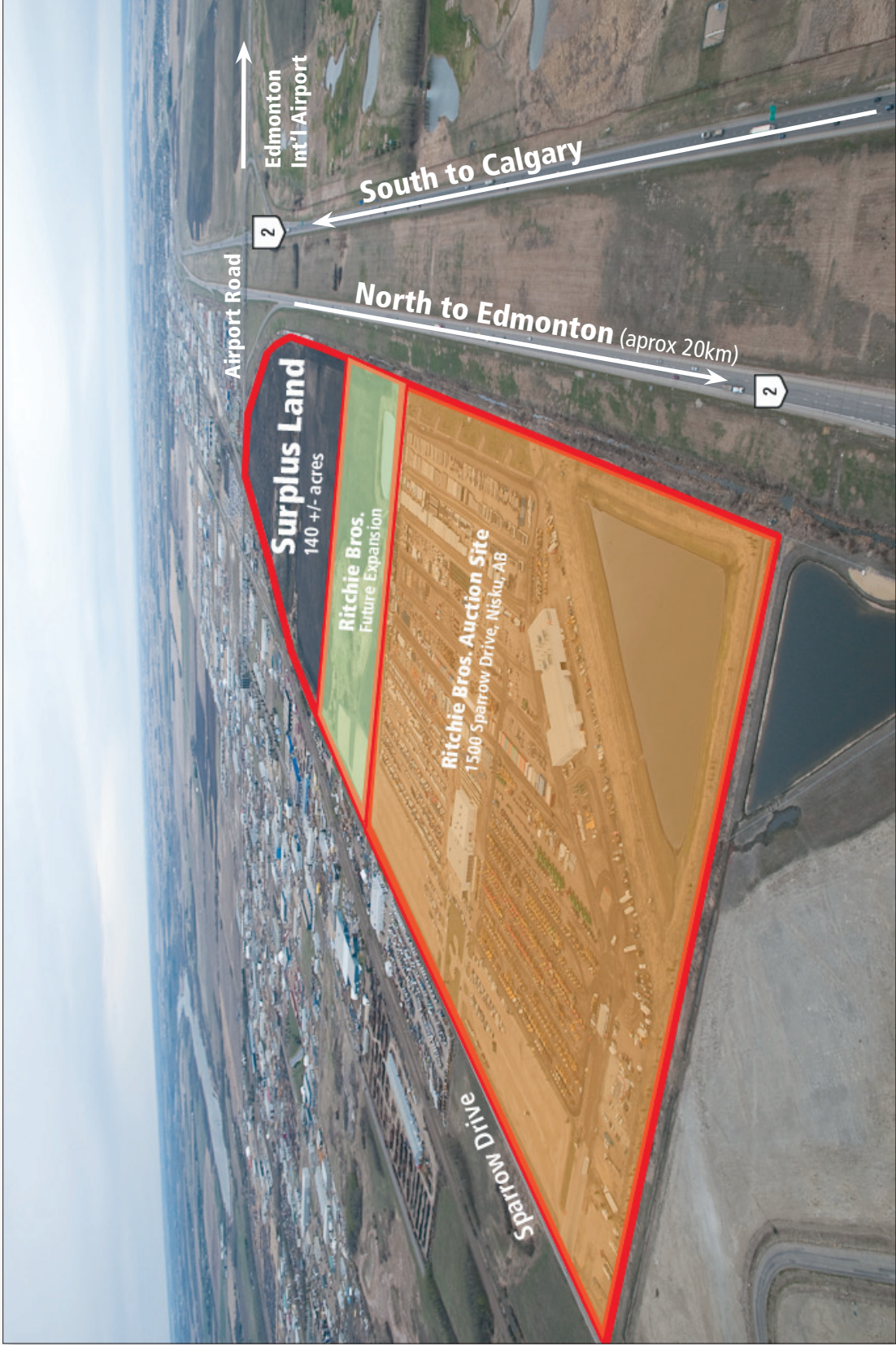
Maps are for discussion purposes only, not to scale